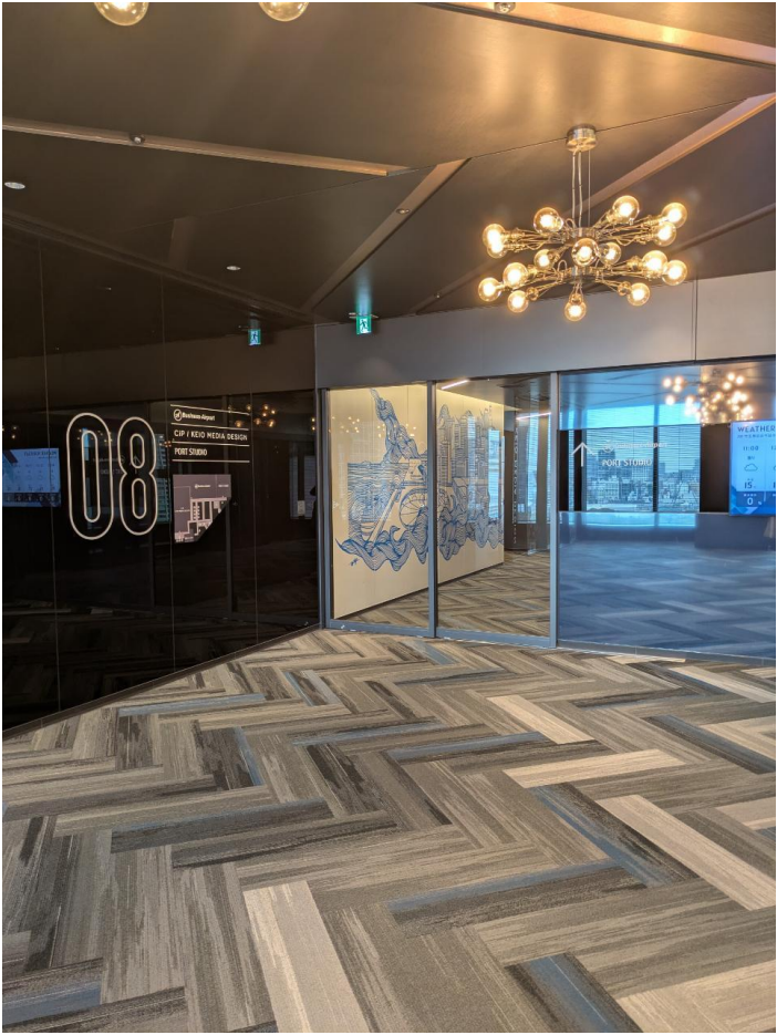
Entrance to the Port Studio