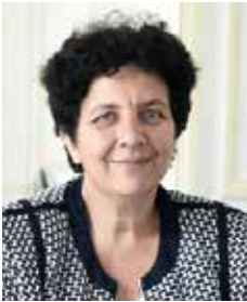
Dr. Frédérique Vidal

Minister for Higher Education, Research and Innovation